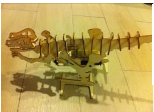
This is the body after gluing the card.