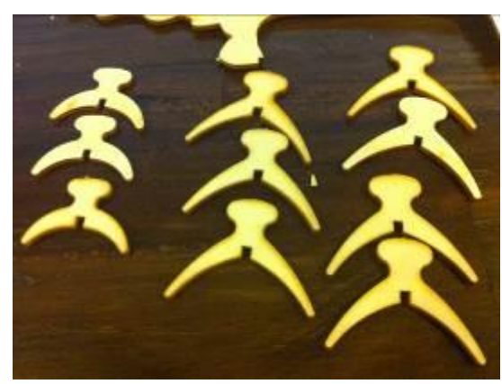
Disassemble and carefully file ribs.