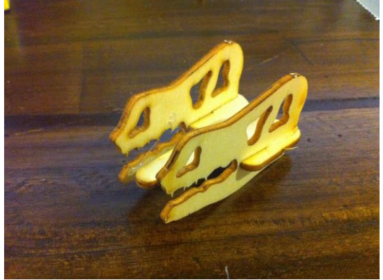
Disassemble and file head parts. Then, let students try and assemble head on their own. Check students' work once finished.