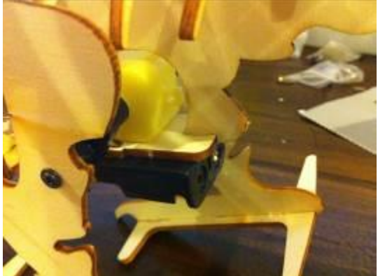
Glue body to card at the card's front and back holes.