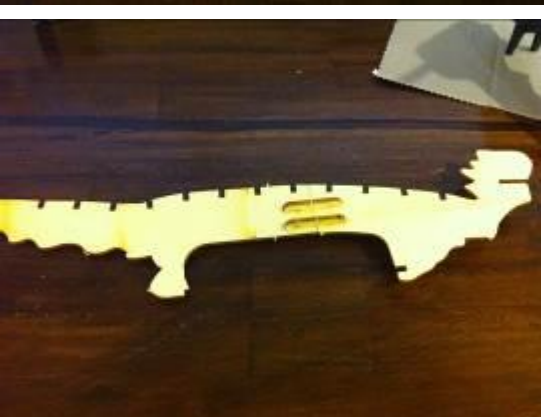
Then, connect the body's front part.