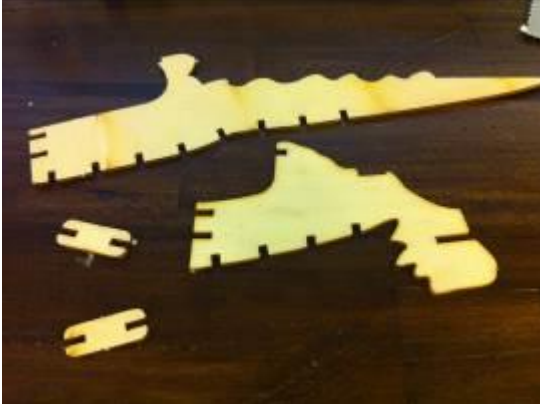
Disassemble and file body parts.