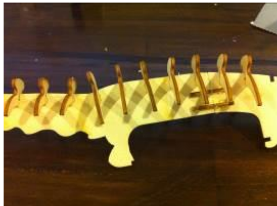
Glue the 3 small ribs in the back (closest to the tail). Then glue the rest from