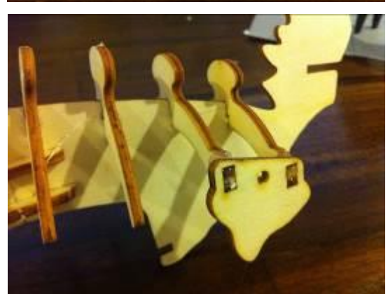
Glue these ribs so that the walls' sticking out sides face backward, as shown in the photo!