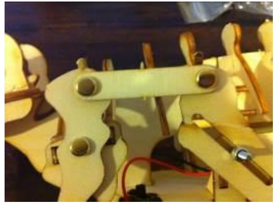
File parts remaining. Connect wooden piece using a paper fastener. Connect arm's top hole to leg's top hole.