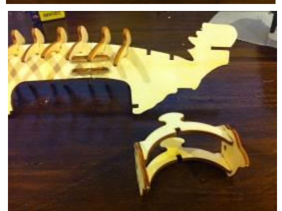
Glue the large ribs.