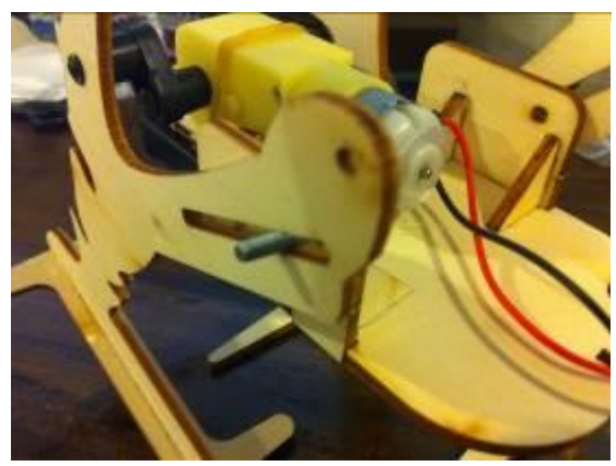
Hand each student a 15 screw and a nylock locknut. Insert the screw from the card's wall to the diagonal hole in the leg.