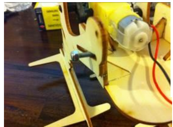
Insert screw from card's wall to diagonal hole of leg. Tighten with a nylock locknut.