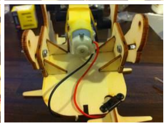
Tighten locknut well, then release a full turn. Check students' work. Then, distribute another screw and locknut, and do the same with the other leg. If connected correctly, legs should be able to stand on their own.