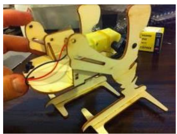
Do the same with the other leg. Check each student's correct placement. You should see the short nails facing each other under the switch.