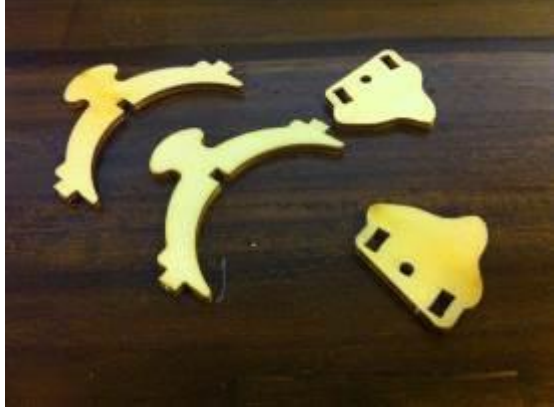
Disassemble the parts in this photo.