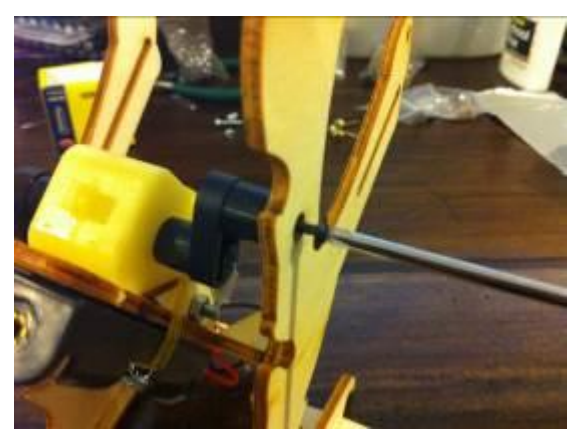
Place the leg's large hole on the crank. Notice that the front nail faces the switch. Hand each student a bug screw, screw it in and release a full turn. The foot's short part is placed under the