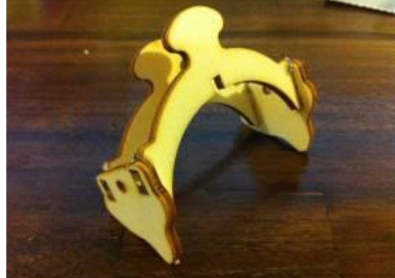
Glue ribs in their place using the walls. Notice that walls are parallel to each other as shown in this photo.